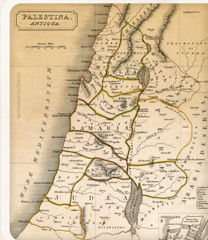
19th century map, engraved and printed in England in 1845, depicting ancient Palestine

NOTE: That does not mean that they are bad people. Each one of them was made in the image of God. We're not talking here about their value, which is great before God, but history.