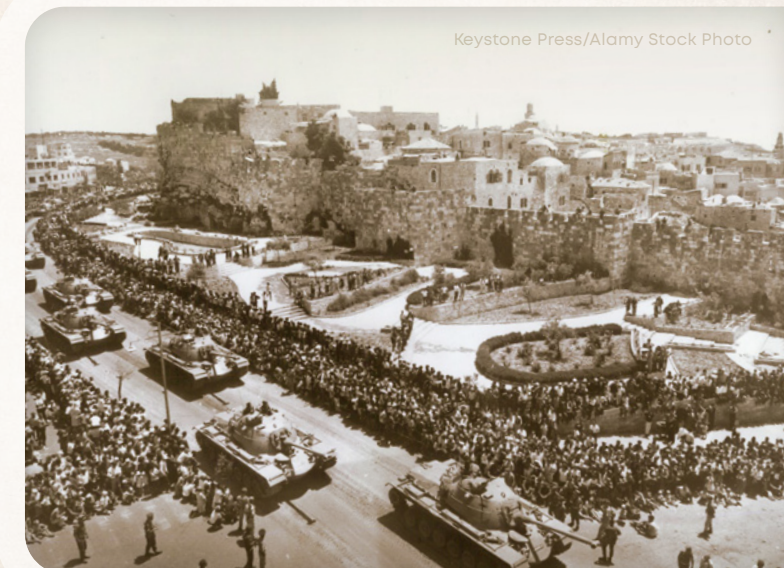
May 17, 1968—Israel celebrated its first year of a united Jerusalem and 20 years of Independence with a big military parade through the streets of Jerusalem.

Israel sent word to the king of Jordan through the United Nations that Israel would not attack their forces if they did not enter the war. Had they heeded that advice, Jerusalem would still be part of Jordan.