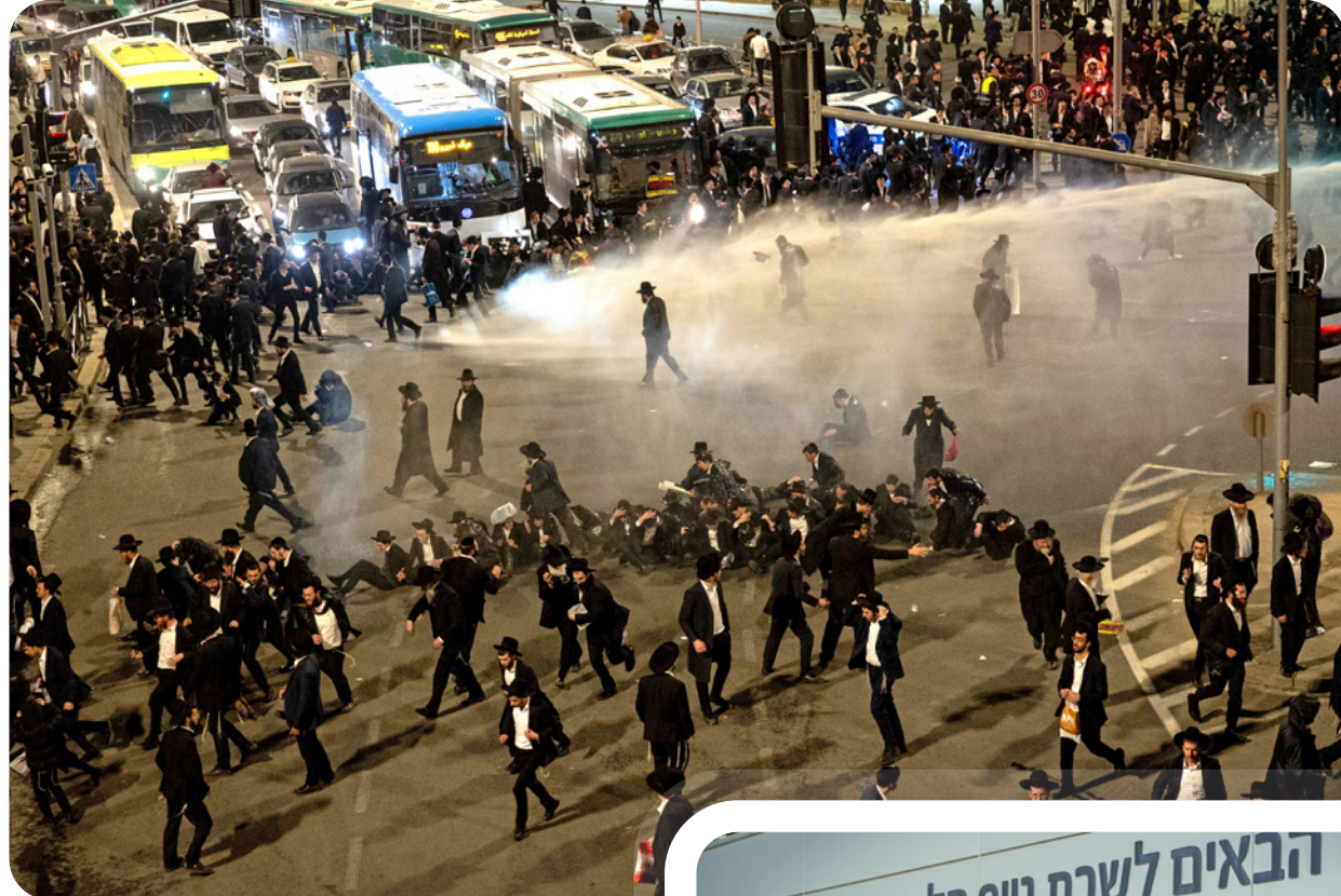
Before October 7 th , the religious community blocks traffic to protest Israeli law that requires all citizens to serve in the army.