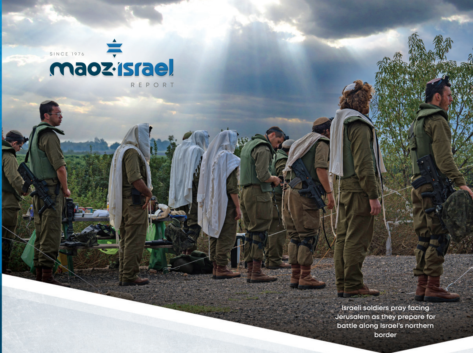
Israeli soldiers pray facing Jerusalem as they prepare for battle along Israel's northern border