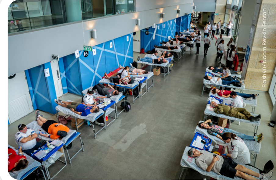
Beds line the walls of convention center as Israelis come in droves to refill Israel's emergency blood supply

In the early days of the war, blood drive stations were set up across the country as hospitals were flooded with thousands of wounded people from the October 7 th massacre. It was the early days of the war and everyone knew why they were there. But as Israelis lay on rows of beds to help others who laid in rows of beds in the hospital, someone began singing Israel's national anthem. It's called Hatikvah, the Hope, for a reason. Hope is the one thing we always have. It is the one thing that no matter how many times our enemies attack, no one has ever been able to take from the Jewish people.