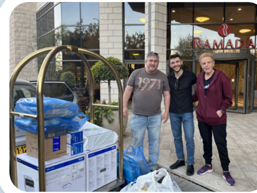
Dropping off supplies for evacuees in a hotel in Nazareth

Maoz Action: Organizing local groups including adults and school kids to help harvest. Recruiting farmers from abroad as well as volunteering in the fields near Gaza ourselves.